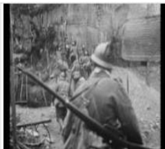
Wartime Footage, 1914-18 [Uni...]