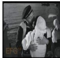
A život teče dalje (1935)